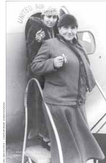
After she moved to Paris in 1907, Alice B. Toklas returned to San Francisco only once, in 1934, during Gertrude Stein's speaking tour.