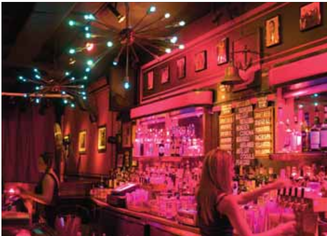
The stand up and shake it clientele at the Boom Boom Room is a beer and whiskey crowd, and the decor is mostly red and black.

Before the first downbeat is also a good