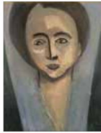
SAN FRANCISCO MUSEUM OF MODERN ART

Michael and Sarah Stein were deeply established in San Francisco's commercial and social life.